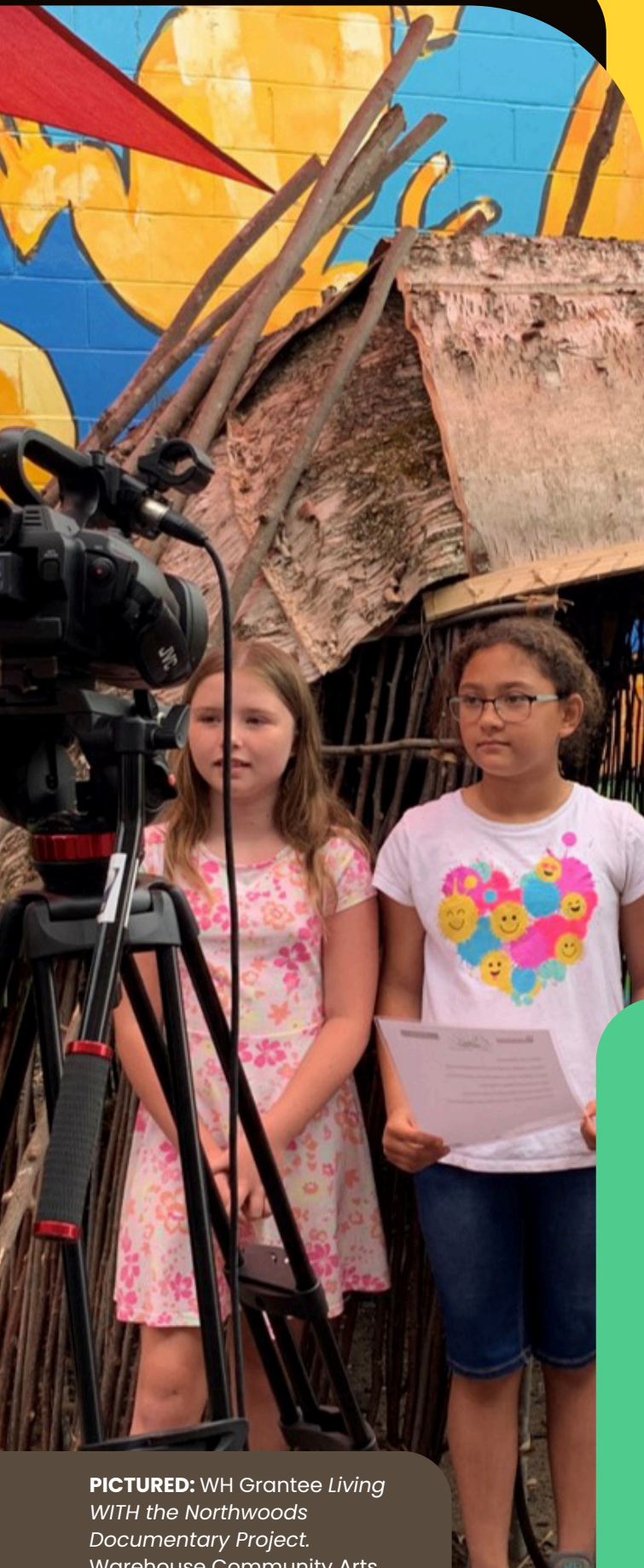
PICTURED: WH Grantee Living WITH the Northwoods Documentary Project. Warehouse Community Arts Center, Eagle River, WI.