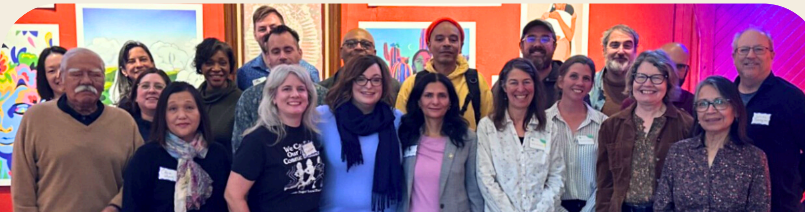
PICTURED: Community Listening Session, Milwaukee WI