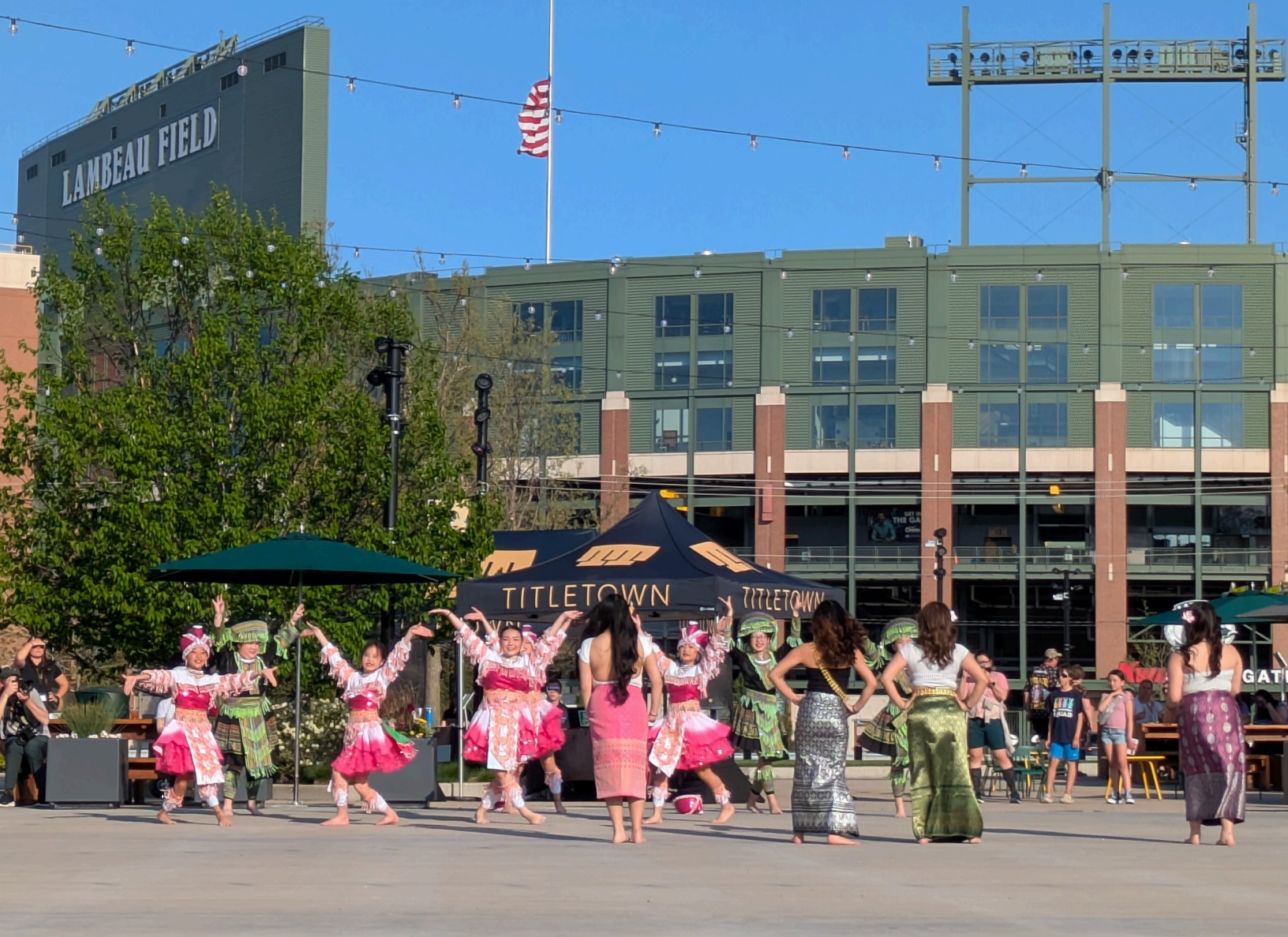
PICTURED: Grantee Hmong Autism Neurodiverse Disability Support (HANDS) Dance Program . Green Bay, WI.